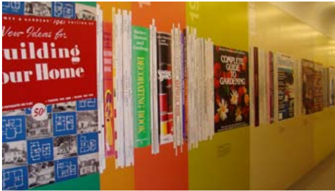
The halls of the Meredith Publishing offices boast an historical timeline of their publishing success.

ISA was given an hour with the editors to introduce them to our organization, present ideas for article topics, and create an understanding of how ISA can assist the publications in producing quality information for consumers. Staff was also given a brief tour of the corporate offices following the presentation.