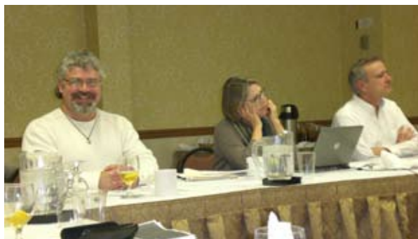
Spirits remained high throughout the Tree Risk Qualification Committee meeting in Phoenix, Arizona.

The Tree Risk Qualification Committee met in Phoenix, Arizona from January 12-14 to work on the new qualification that ISA hopes to launch in 2011. The meeting was a huge success as everyone was eager to dive into the logistics and iron out all the kinks. The committee discussed and finalized learning objectives, goals for the qualification, how this qualification fits into an international profession, training materials, and the possible assessment types. Great discussions lead to decisions being made and a tentative timeline was set into place. Committee members are volunteers and experts in their field. Their experience and contributions were assets, especially from a global perspective. The committee will meet this spring and again at the ISA Annual Conference in order to be able to introduce this new program to the profession in 2011.